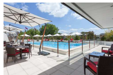
Notre Terrasse Espace