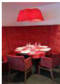
Restaurant Brasserie M