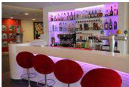
Bar « QUAI 44 »